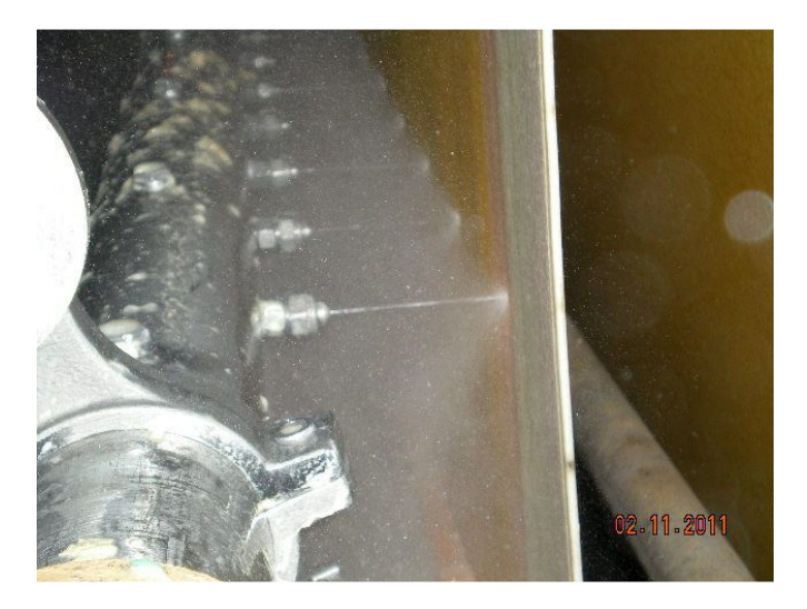
Figure i. High pressure needle showers can effectively cleaning localized sections of the press fabric

Compared to a method that applies the cleaning chemistries across the entire fabric width, the high pressure needle jets allows a more effective concentration to be achieved in the localized felt section being cleaned at a given moment. Figure (i) shows a typical high pressure needle shower on a press fabric.