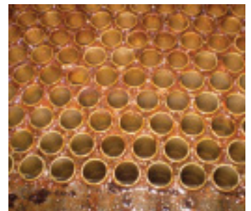
Clean Tube Sheet