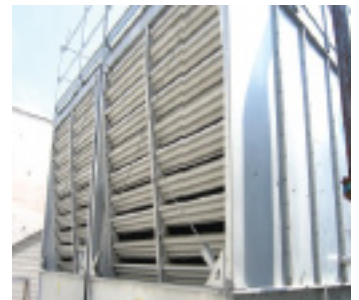
Drained Cooling System