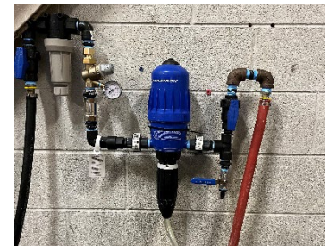
Dosatron Mixing Station