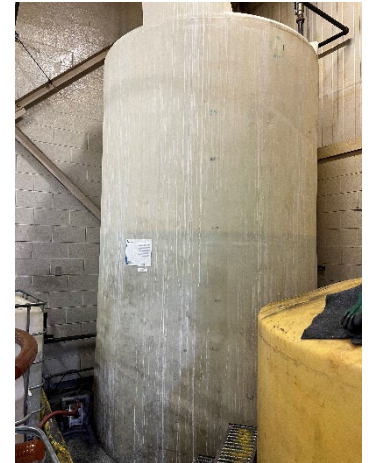
Radi-Aze Bulk Tank

Upon implementation, the customer found that Radi-Aze provided the cleanest floors as evaluated by the operators. The floor dried quickly and were not slippery. They saw a reduction in the oil build-up and were satisfied with its removal, especially in the areas susceptible to heavier oil mist. The dried floors have drastically reduced the chances of an operator slipping and falling when working in these areas, resulting in a safer work environment. The customer now keeps Radi-Aze in stock in a bulk tank to maximize their floorspace and inventory requirements. This bulk tank then connects to a proportioner mixing station, to which operators can easily pull up a floor scrubber to refill. The customer and DuBois technical team continue to evaluate additional opportunities for improvement and appreciate their continued partnership.